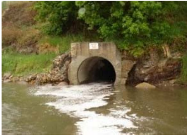
Terra Erosion Control, Ltd.

To report a suspected storm water illicit discharge violation anonymously, call Pollution Emergency Alert System at 1-800-292-4706. You can also call Huron River Watershed Council at 734-769-5123 or call Hamburg Township Utilities at 810-222-1191.