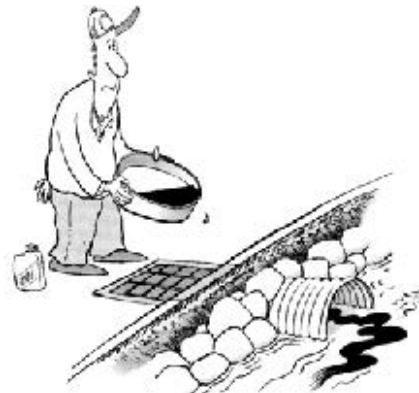
Solid Waste Institute of Northeast Oklahoma

The point in a storm sewer system where it empties into a body of water is a storm sewer outfall. It may be a pipe or ditch. If the outfall is flowing when there has been no recent rainfall, this may indicate an illicit discharge. Visible sewage waste, foul odor, suds or other evidence of contamination, are indicators that an illicit discharge is contaminating the storm sewer.