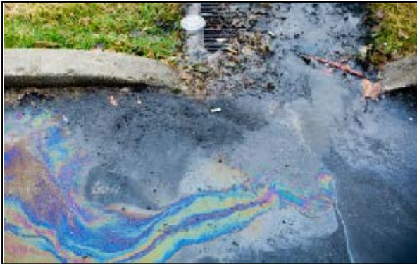
Millers River Watershed Council

You can identify a storm sewer by the open grates along roadways and within some low-lying areas.