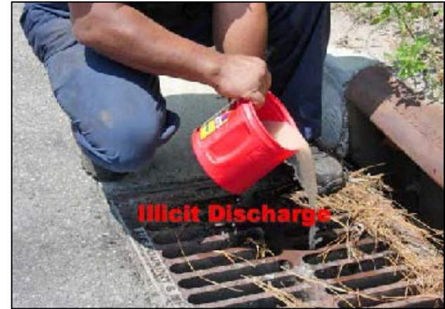
City of Portage, Michigan